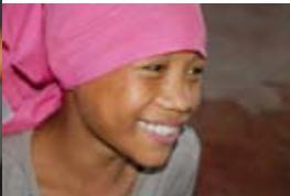
Educational programme in Thailand.