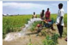
Reconstruction project in Bangladesh.

Indonesia: Construction of a school in Becari nine months after the earthquake, enabling 200 children from neighbouring villages to continue their schooling as normal. Budget: 200,000 €.