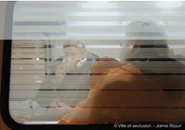
© Ville et exclusion - Jaime Razuri