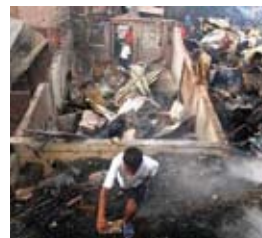
Fire in the Monravia quartier of Medellin (Colombia).

Colombia: February / July / November 2007 in Medellin, Monteria, Cartagena and Santa Marta. Aid for victims of natural and technological disasters: distribution of 12,200 food and hygiene kits.